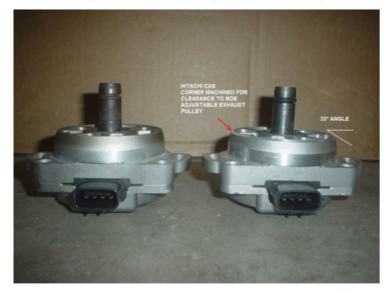
Figure 3 – Hitachi CAS, stock (left), modified (right)