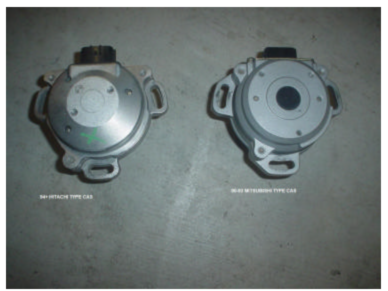
Figure 2 – Hitachi (left) vs Mitsubishi (right) CAS